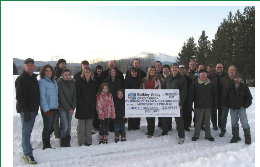
December 8, 2011 saw the Telkwa contingent of BVCU staff at the Telkwa barbeque grounds to assist in the presentation of a major donation of $30,000.00 to the Bulkley Valley Kinsmen Club as the Platinum sponsor of the Band Stand Legacy Project that will be built in the spring and early summer of 2012.