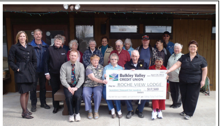
A BVCU representative from the board, management and staff were on hand to make the presentation to the Roche View Lodge Society in New Hazelton for $17,500 in celebration of the 70th Anniversary.

The renovation project to upgrade the washroom, kitchen and service areas of the Driftwood Hall to keep this historic asset available for the community. Congratulations to the Glenwood Hall Committee.